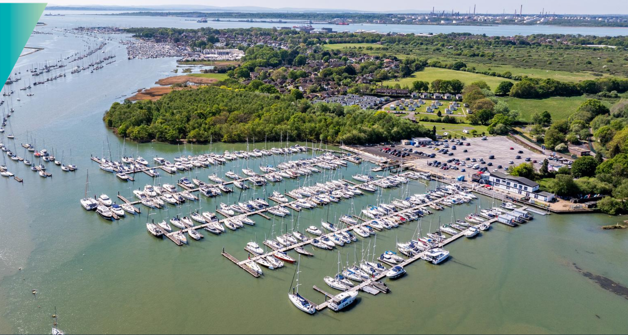
MERCURY YACHT HARBOUR, HAMBLE, SO31 4NB